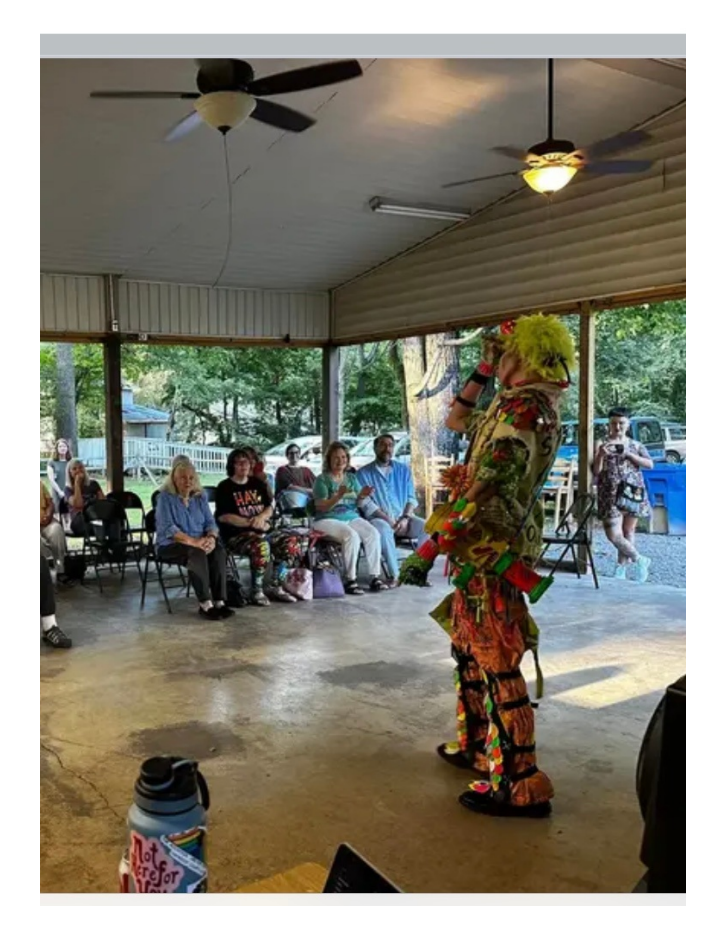
Is this a freak show?