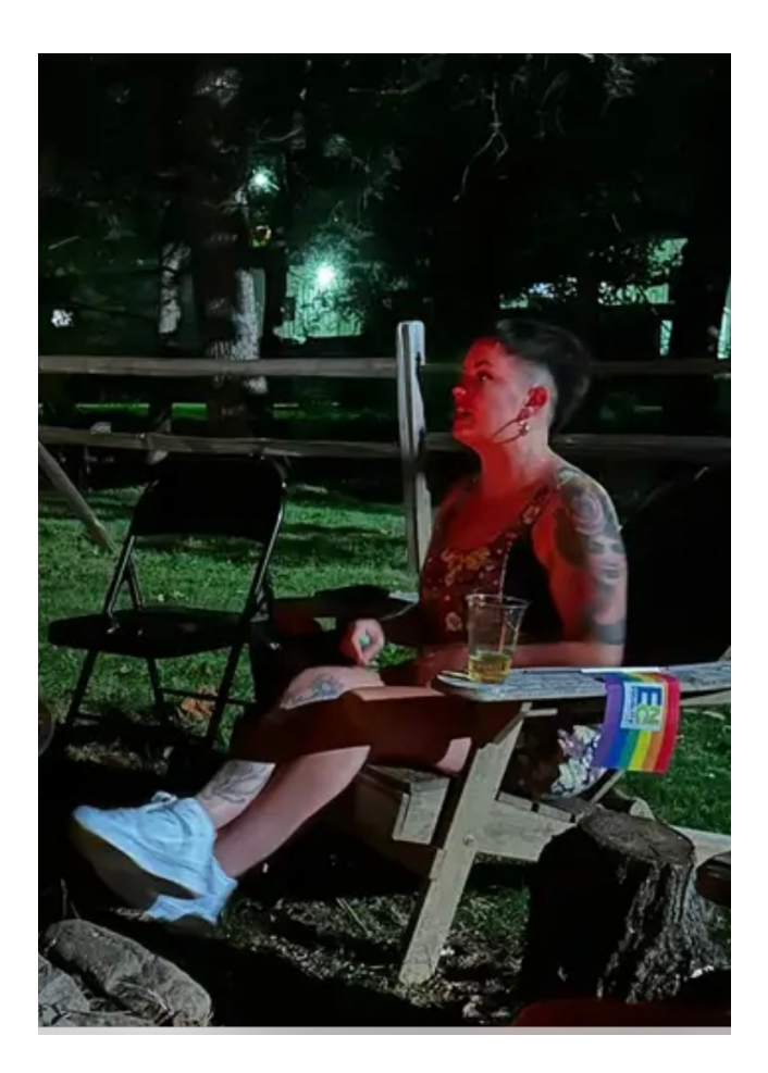
Who is this???