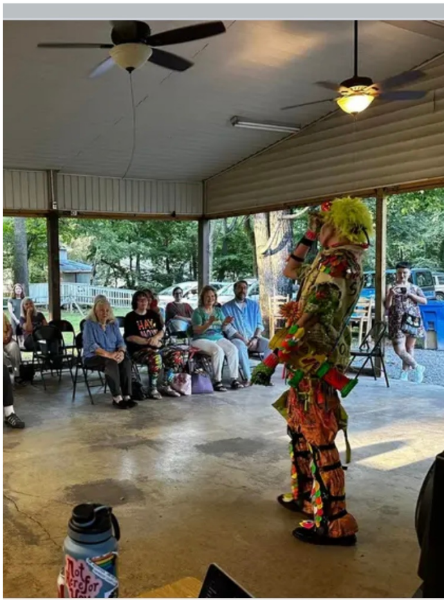
Is this a freak show?