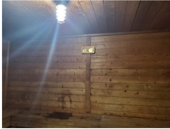
Rec Center Sauna

Email summarizing the meeting and new Request for Public Information.