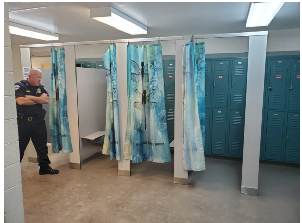
Rec Center Women's Locker Room