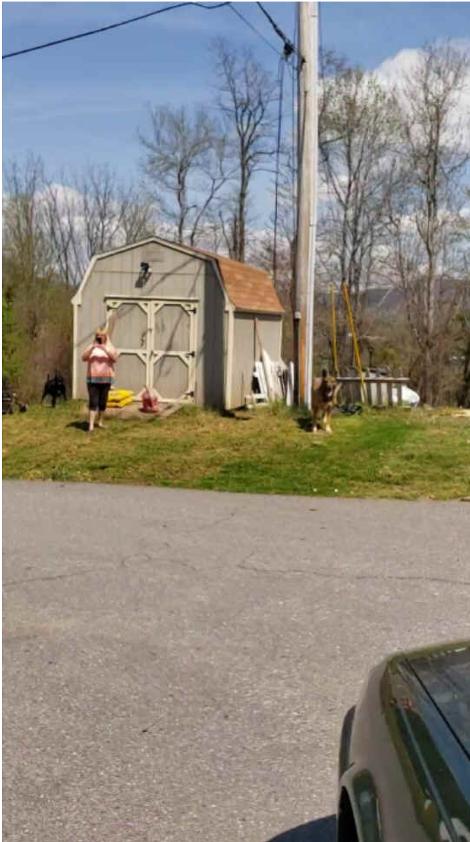
Here is another photo, frame grab from the same 120 second video, showing Sharon Ramsey way down the block. Obviously, she was too far away to be a credible witness.