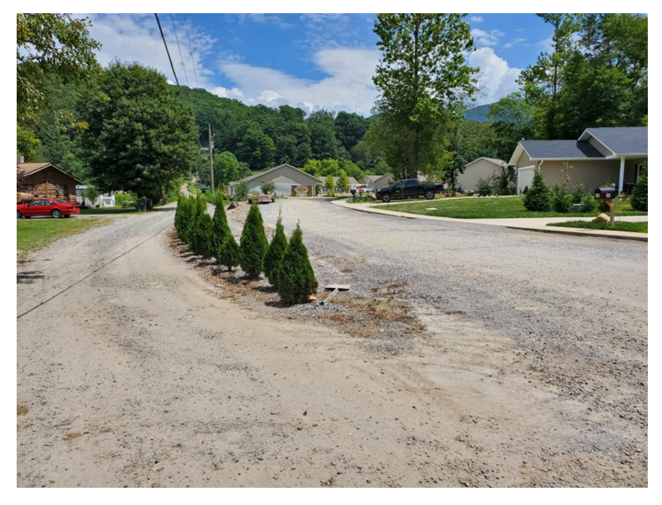
Whoa! Someone smashed the [expletive deleted] out of the other sign, denoting "PRIVATE DRIVE - RESIDENTS ONLY - NOT A THRU STREET"!

Well look at this! The road leading into Browning Branch LLC development is still a dusty gravel road, as it has been also since the beginning of time.