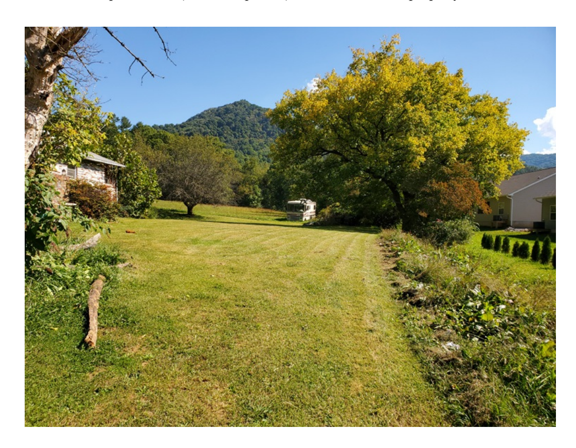
Here is the view from near the gravel road, looking up the creek.