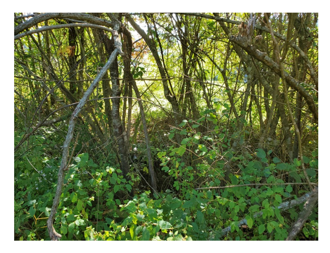
Here is the (buried) culvert poking out of the ground, well into the creek area. It appears to be black plastic culvert pipe, about 12" diameter, I would guess.