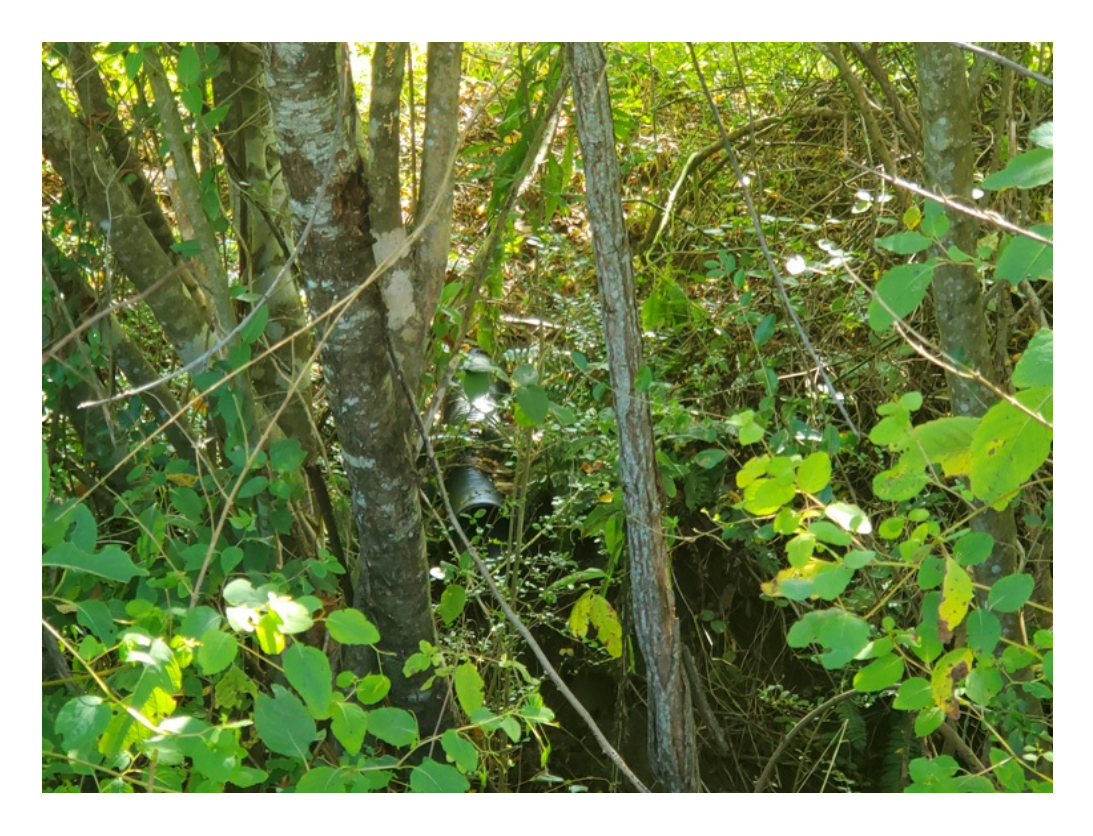
Here is a tighter shot.