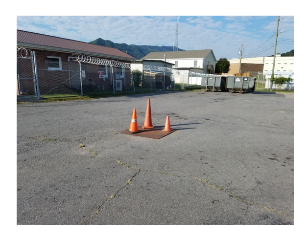
A sunken pothole.