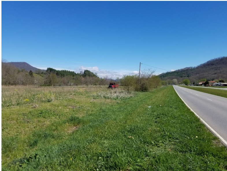
Parked at the entrance, looking to the right (west). Nothing but an old dump truck parked off in the distance.