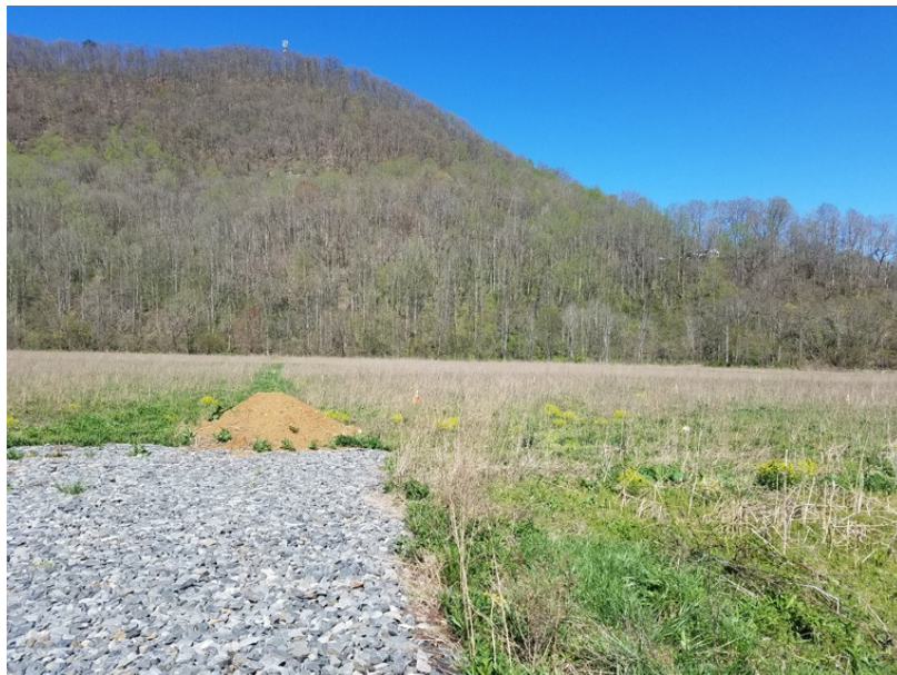
Looking at the same pile of dirt blocking the entrance when it was determined that the Publix dirt was not going to be satisfactory. Nothing but weeds. Now the field will have to be cleared again, and piled on top of the first scraping months ago.